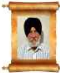
DR. 1994 BIRU JODHPUR DISTRICT, DC