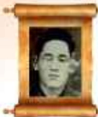
MAJ. PM, VMH 1990-99