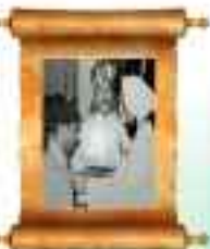
MAJ. VMH 1990-99