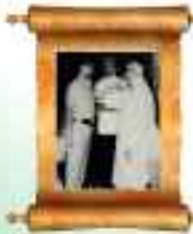
05 - 001 280 1071 06 MANDIANTIC, SC