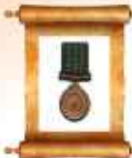
SG - 1064 AC (JRN) S. SARDARWAL, AC