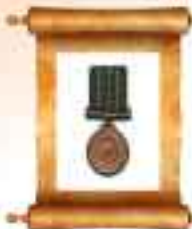
SG - 25743 GCR SARDAR, SANGRUR, SC