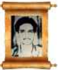
07 - 10710 401 08 KIVPA, SC