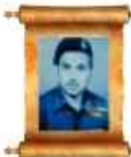
MAJ. VMH 1990-99