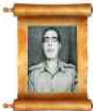
NO - 10009 PDS BAGELI CHAKRI, SC