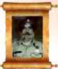
NO - 04400X, PDS BETRAL, BAGELI, SC