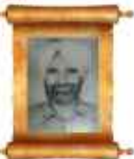
10 - 2013 004 WARRANT OFFICER S/O