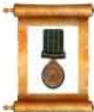
NO - 10010 000 WIPRAL WIPRI, SC