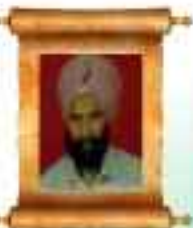
SG - 25743 GCR SARDAR, SANGRUR, SC