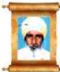
10 - 2013 001 WARRANT OFFICER S/O