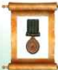
2D - 3954 AB (CV) Harshraj Singh, SC