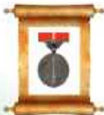
03 - 30242 040 MAMABOLU SERA, 04