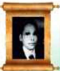
10 - 2013 002 WARRANT OFFICER S/O