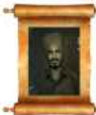
01 - 30240 040 MAMABOLU SERA, 04