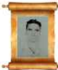
SG - DETON, PAK C/COMMAND, SC (POSTAL/DIR)