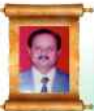
NO - 2001 00 0000 VISHU BUNAR KATHAL, SC