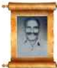
SG - 25743 GCR SARDAR, SANGRUR, SC