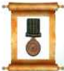
SS - 19993 NLT JAG NALL, SC (PROTHOMODAY)