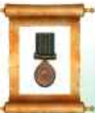
SS-10318 CHANNA DORING DASA, SC