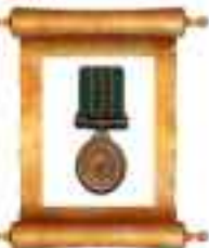
CPL, GDR 1990-99