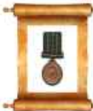
00 - 771 400 (09) K P BATH, SC