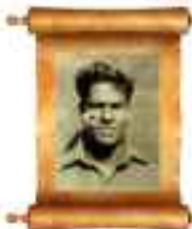
1A - 4741 OCB Anandaram, SC