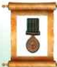
NO - 1076 480 (BAM) BY VERMA, SC