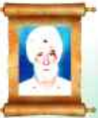
DR. 2001 BIRU SAMALPUR DISTRICT, DC