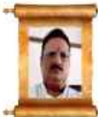
SS-10243 KRI NAV JAYRAMA, SC